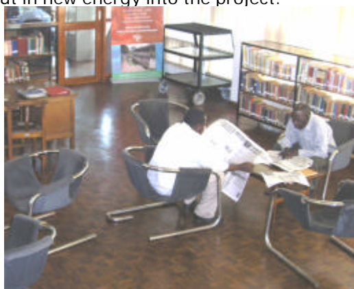
Proposed location for the YRIC