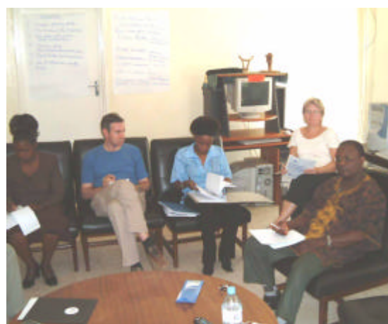
Project committee members