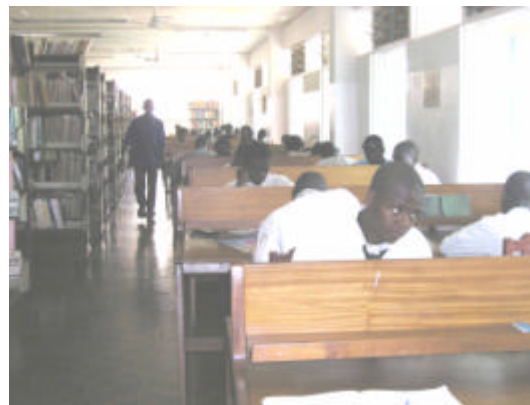
Busy students in the library