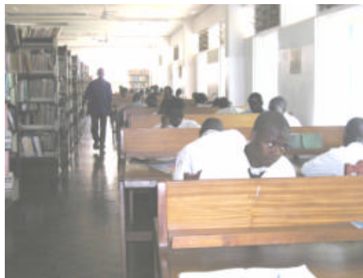
Busy students in the library