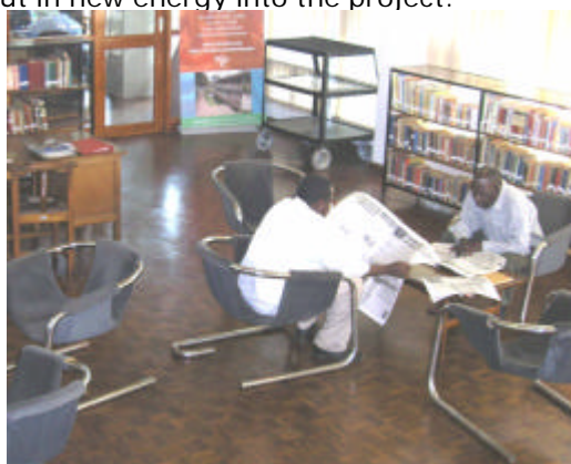
Proposed location for the YRIC